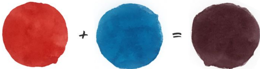
Warm red (Pyrrrol Scarlet)