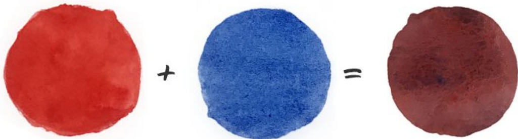
Warm red (Pyrrrol Scarlet)