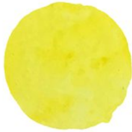
Cool Yellow (Lemon Yellow)