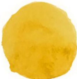
Warm Yellow (New Gamboge)