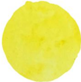
Cool Yellow (Lemon Yellow)