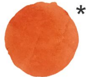
Saturated Orange *