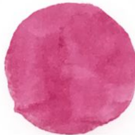
Cool red (Quinacridone Rose)