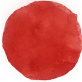
Warm red (Pyrrhol Scarlet)