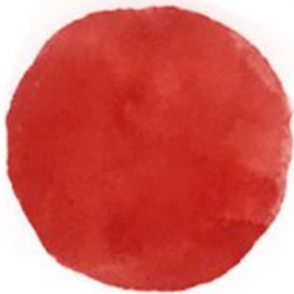
Warm red (Pyrrhol Scarlet)