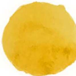
Warm Yellow (New Gamboge)