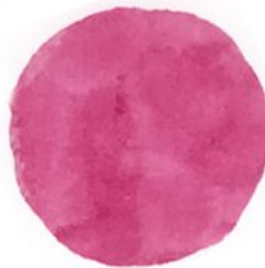
Cool red (Quinacridone Rose)