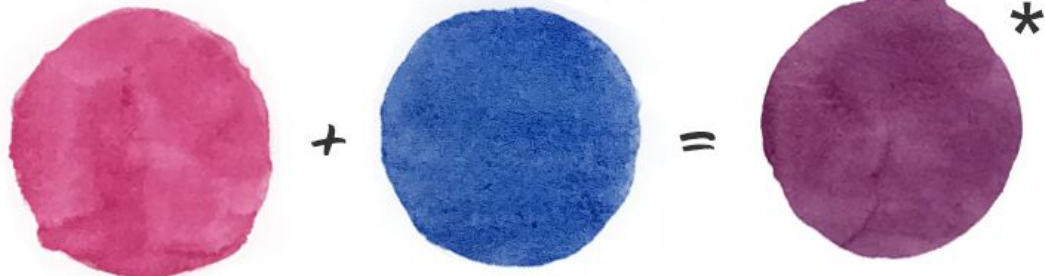
Cool red (Quinacridone Rose)